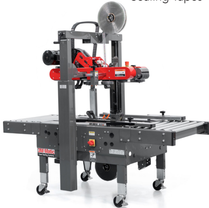
2" Scotch® Box Sealing Tapes