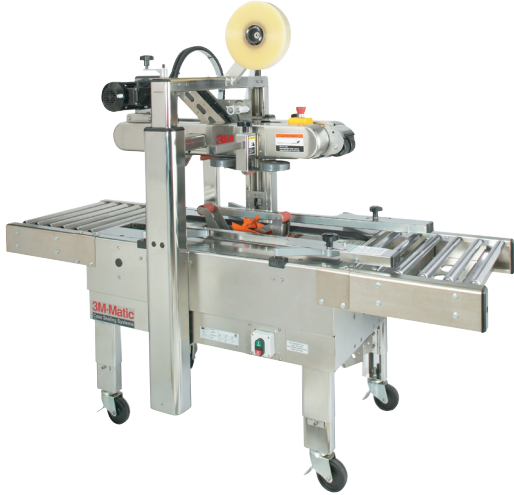
3M-Matic™ Case Sealer 700a-s