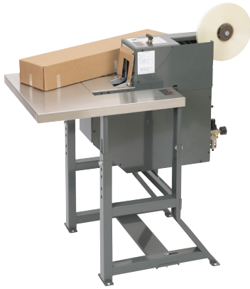
S-867 Single Head Applicator