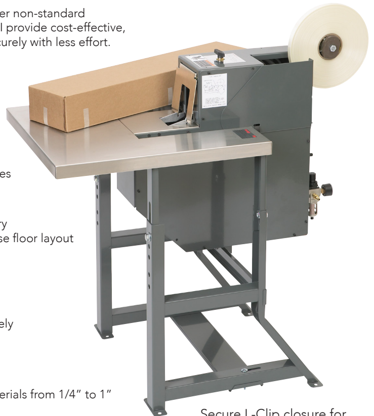
Secure L-Clip closure for non-standard packages

Starting with the same features as the S-867, the S-867 II dual head configuration simultaneously applies two L-Clips side by side as close as 8” apart. Packages are easily moved and positioned across the stainless steel roller ball work surface.