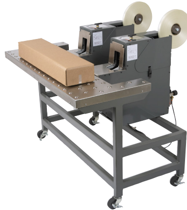
S-867 II Dual Head Applicator