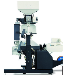
65 in. (165 cm)