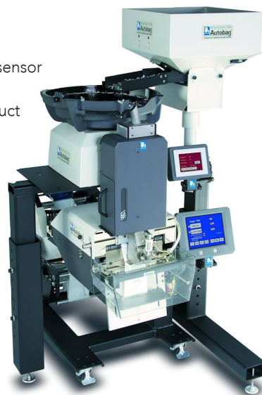
Economic and Flexible counting solutions can be achieved with the Autobag Accu-Count 100 series of automatic Count-n-Pack systems.