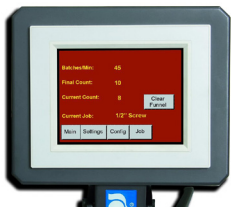
Operator friendly AutoTouch™ Control Screen for easy job set-up, job recall and diagnostics