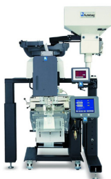
43 in. (109 cm)

Air Supply: 80 psi (5.5 bar); 0.5 cfm (0.0002 cms)