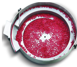
Optional bowls The Accu-Count 200 include stainless steel, coated stainless steel, or coated cast aluminum