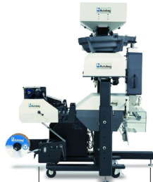
48 in. (122 cm)