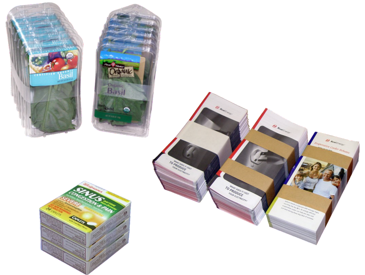
Optional Band Lifter