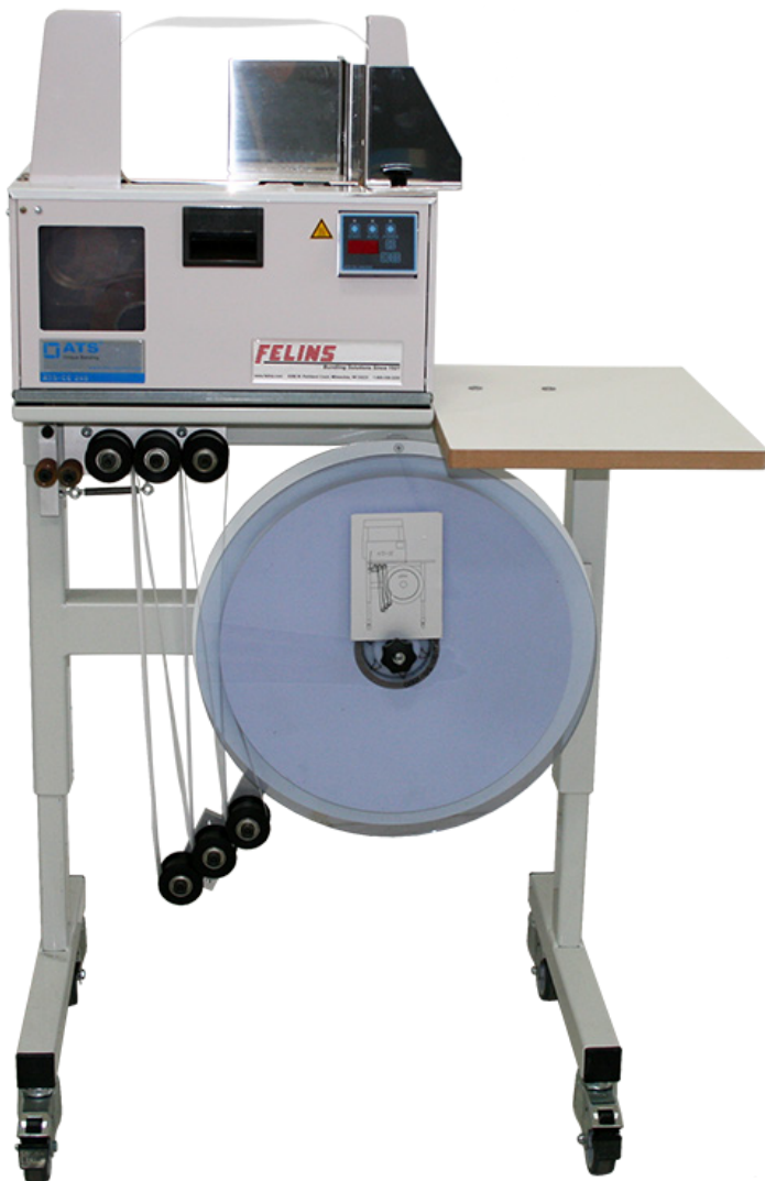
Shown with optional long roll stand and product table