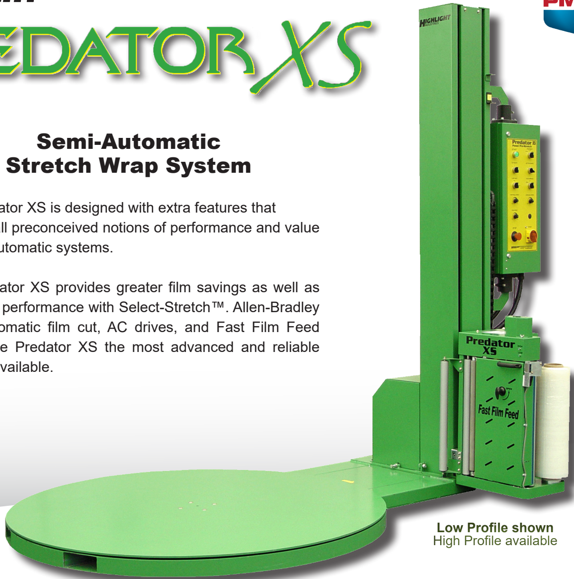
Low Profile shown High Profile available

The Predator XS provides greater film savings as well as improved performance with Select-Stretch™. Allen-Bradley PLC, automatic film cut, AC drives, and Fast Film Feed makes the Predator XS the most advanced and reliable solution available.