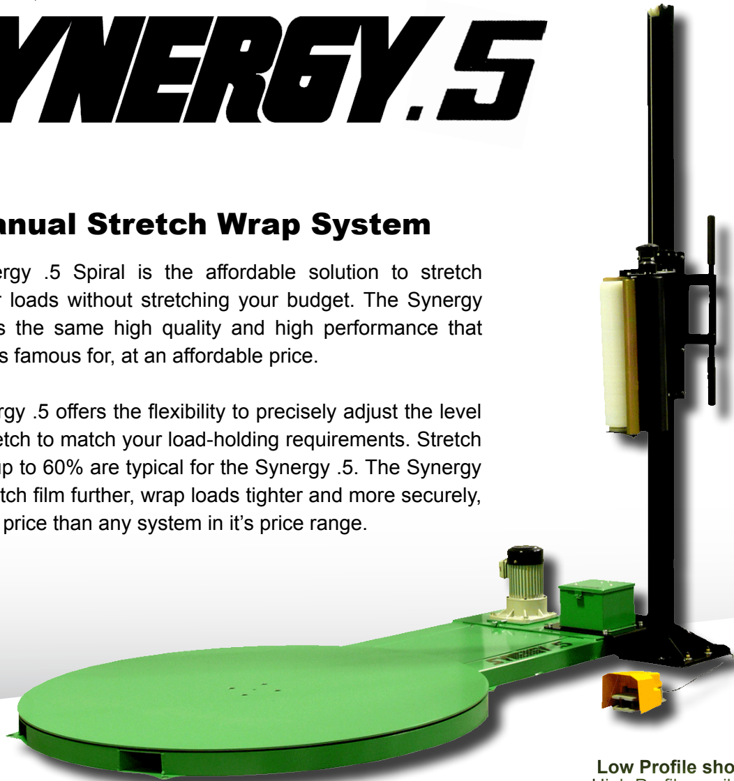
Low Profile shown High Profile available

The Synergy .5 offers the flexibility to precisely adjust the level of film stretch to match your load-holding requirements. Stretch levels of up to 60% are typical for the Synergy .5. The Synergy .5 will stretch film further, wrap loads tighter and more securely, at a lower price than any system in it's price range.