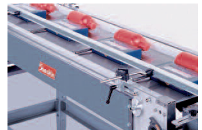
Adjustable Flight Bar Infeed